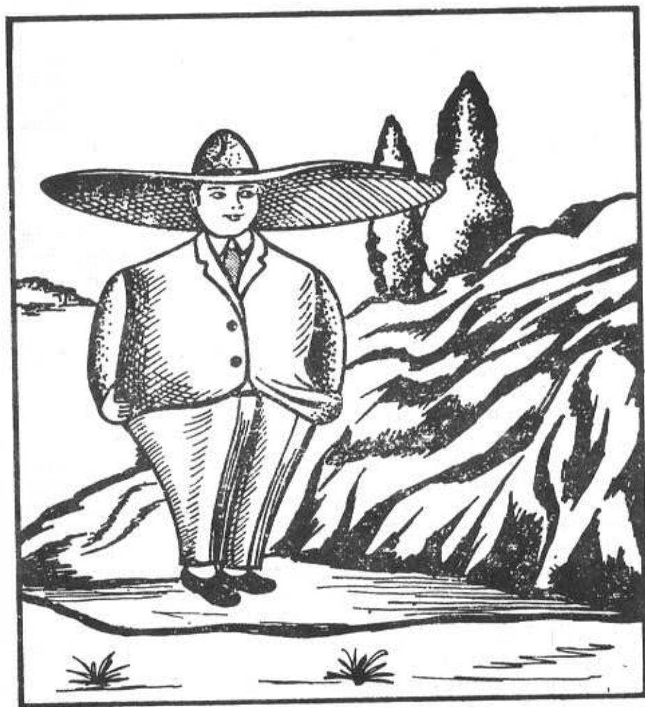
Prayer of the ENCHANTED ELF