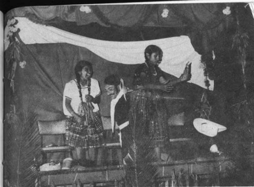
Praise of indigenous. Ciudad Vieja, Sacatepéquez.

He argued such thing based in the Franciscan Guillermo de Ware who teaches before 1300 the Inmaculada Concepción about his famous principle: potuit, deuit, fecit . 4