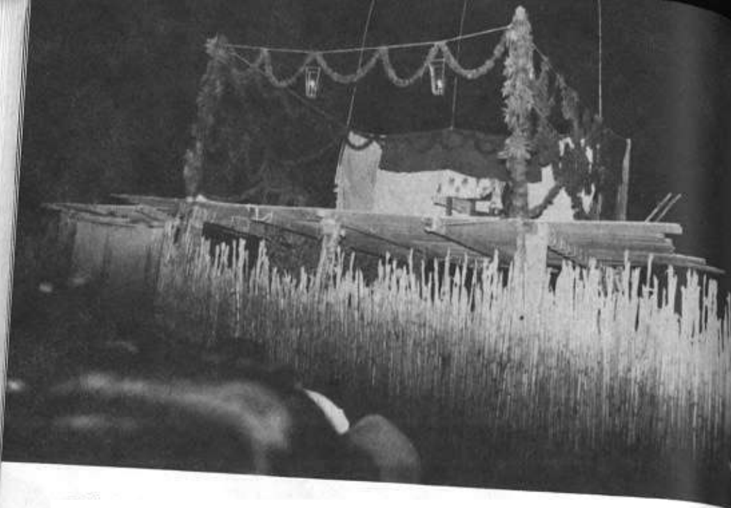
Stage for praise. Sumpango, Sacatepéquez.

The director-producer requests several persons of his community for help him to show. The devotee people that accept to participate, he gives them a document with two months of anticipation" (A).