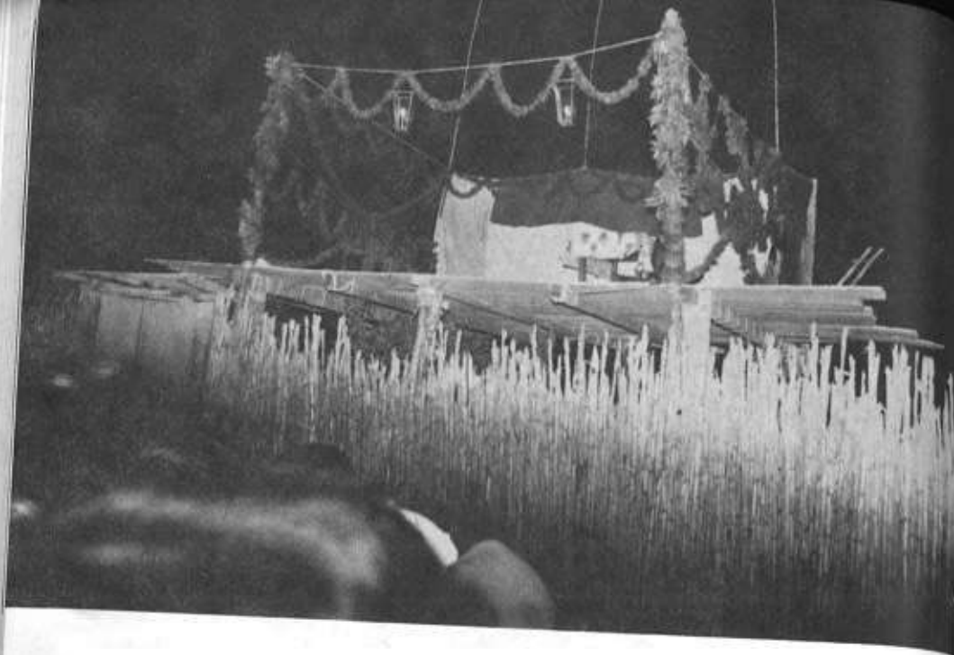
Stage for praise. Sumpango, Sacatepéquez.

The director-producer requests several persons of his community for help him to show. The devote" people that accept to participated, he gives them a document with two months of anticipation" (A).