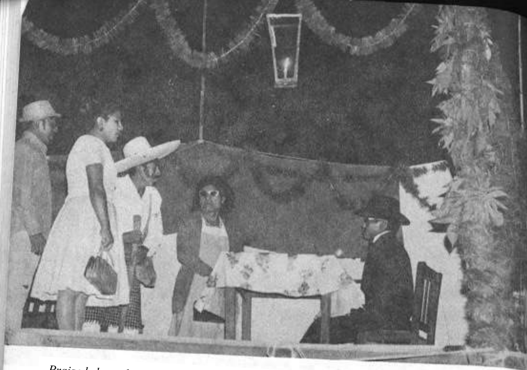
Praised showed in Ciudad Vieja, Sacatepéquez.

In 1621 the Franciscan Order declare to the Inmaculada Concepción a principal patron of Order. In 1760 is declared patron of Spain and her Indias. The township grew in enthusiastic about ministry enriching the celebration with its competition. 5 Finally, in front of overwhelming requests, Pío IX on December 8 th , 1854 declare dogma of faith to until pious belief”.